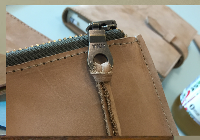
A glimpse at the final zipper selection for the Leather Travel Pouch - the 8" YKK chain and donut slider in an antique brass finish.