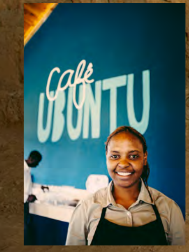
Ubuntu operates Cafe UBUNTU in Maai Mahiu. It has become a model for future development in the area.