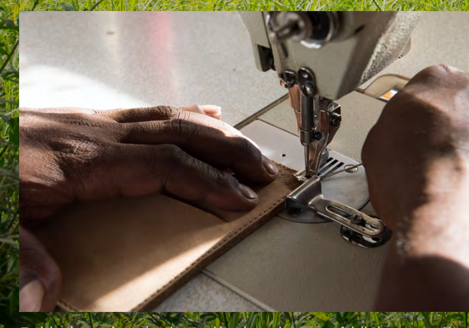
Each leather product is hand-cut and hand-sewn by a team of skilled artisans in Kenya.