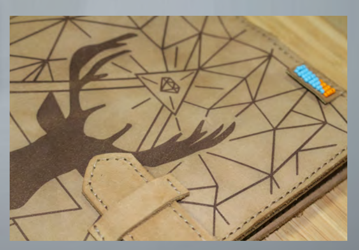
One-of-a-kind designs meet first-of-its-kind technology. Zazzle's cutting-edge laser etching process allows for a truly unique customization process.

Dur unique halftoning tool allows anyone to upload a whoto and instantly generate a beautiful piece of artwork which is suitable for laser embellishment on The Adventure Collection's leather goods.