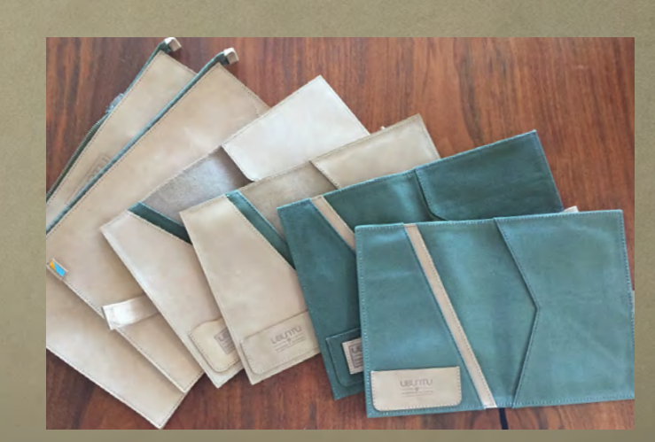
Countless iteration – around the clock and over many months – resulted in a final collection that surpassed everybody's original expectations.