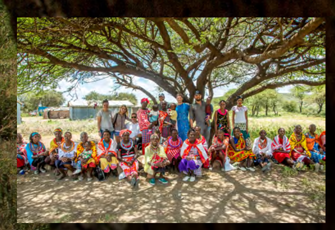
The Zazzle Heart team traveled to the Rift Valley in Kenya to co-develop The Adventure Collection with Ubuntu and the Maasai people of Kenya.

This journey fundamentally altered the course of the collection and resulted in a level of quality and uniqueness that the world has never seen.