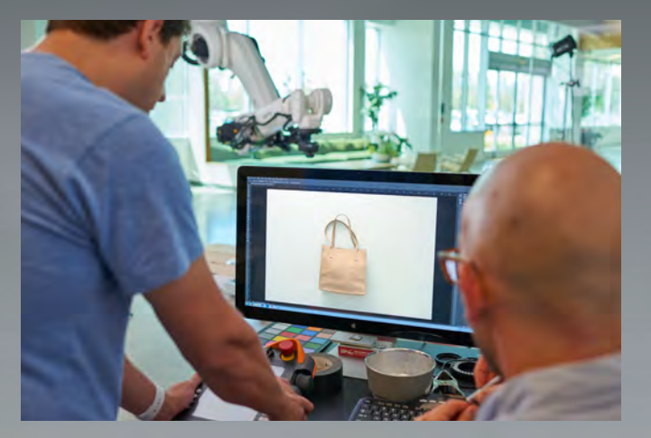
Zazzle's visualization robot, Talus, automates the photography process which enables the ultimate in precision for real-time visualization of artwork and customization online.

Not only are these products produced at the highest quality, they are creating opportunity for makers on the other side of the world, enabling stateside artists and designers to emblazon them with unique artworks and content, and inviting customers to make their personal mark through customization. This is truly a revolution in the making .