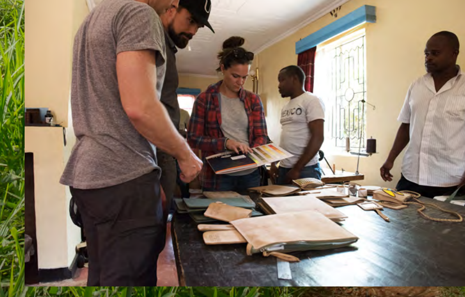
Zazzle and Ubuntu spent months developing and iterating upon The Adventure Collection to ensure the highest level of quality in every element of production.