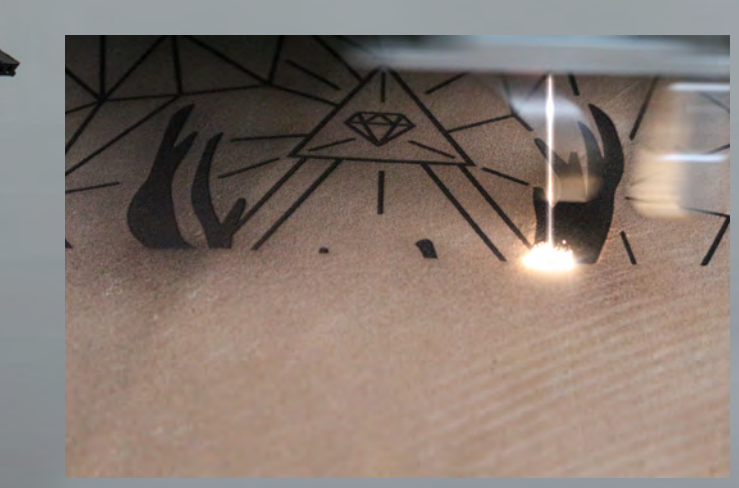
Our laser embellishment and post-sew process is the first its kind for high-end leather fashion. When we say "make your own," we mean it.